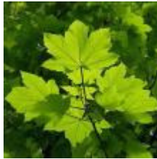
Acer Pseudoplatanus Sycamore

A deciduous tree growing to 20-30 m tall with a trunk up to 1.5m diameter, and a broad, rounded crown. The autumn colour is usually yellow, occasionally orange-red.