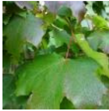
Acer Platinoides Norway Maple

A deciduous tree growing to 20-30 m tall with a trunk up to 1.5m diameter, and a broad, rounded crown. The autumn colour is usually yellow, occasionally orange-red.