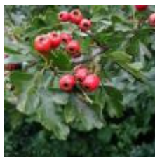
Crataegus Monogyna Whitethorn

A medium-sized to large deciduous tree attaining a height of 20-35 m with a trunk often 2 m in diameter. The leaves are long ovals with toothed margin.