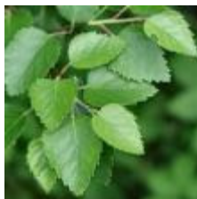
Betula Pubescens Common Birch

Silver-grey bark, Oval leaves with pointed tip turn yellow in autumn. Fast growing grows to 20-25m. Silver Birch found mainly on dry, sandy soils.