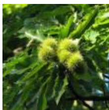
Castanea Sativa Spanish Chestnut

Common in damp areas. Young branches are bigger than silver birch, has grey bark often covered with lichen and moss. Slower growing than silver birch. The leaves are oval with a pointed tip and finely serrated margin. Grows to 15-20m.