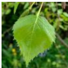
Betula Pendula Silver Birch

Common in wet ground, marshes and stream-sides. Rounded leaves are light green. Flowers green catkins (Feb - March) that become black when ripened a year later. Fast growing. Grows to max of 20m. Timber uses include woodturning and charcoal.